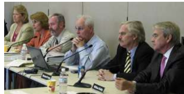
Delta Vision Task Force