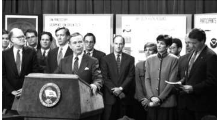
Bay Delta Accord