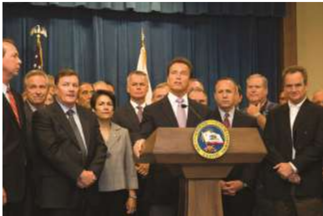
2009 Comprehensive Package