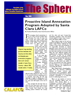
The Sphere keeps members up-to-date on issues and events