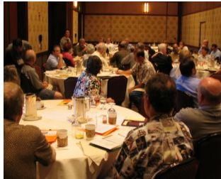
Conferences and workshops provide exceptional educational and networking forums

Changes in state law not only altered the role and responsibilities of LAFcos, but mandated that new studies, such as municipal service reviews, be conducted. With limited staff, LAFcos often rely on consultants to draft many of these fiscal and policy studies. Associate members are an important source for LAFcos and community groups to turn to for assistance with studies and services.